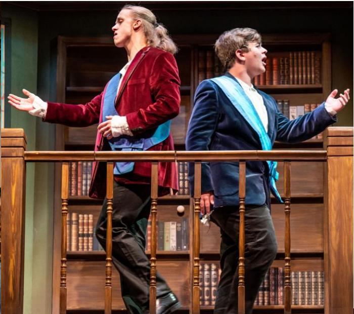
Pictured: Cast members of INTO THE WOODS (clockwise) 1 - Lucinda, Cinderella's Stepmother & Florinda, 2 - Rapunzel's Prince & Cinderella's Prince, 3 - Witch & Rapunzel, 4 - Wolf, 5 - Little Red Ridinghood, 6 - Cinderella | Grand Theatre 2022