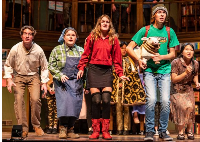
Pictured: Cast members of INTO THE WOODS (clockwise) Baker, Jack's Mom, Little Red Ridinghood, Jack, Cinderella | Grand Theatre 2022