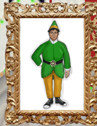
COSTUME SKETCH BY DANA OSBORNE